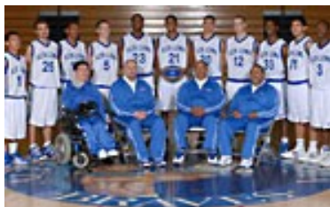
Wagadoo Uniform Alta Loma