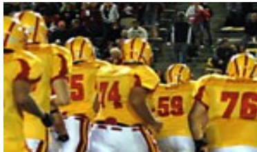
Herald Football Team